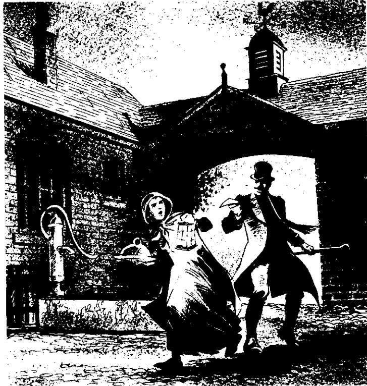
Edith ran past the man to the stables.

'Oh Ned!' Edith cried, but before she could say any more, the stranger came up behind her.