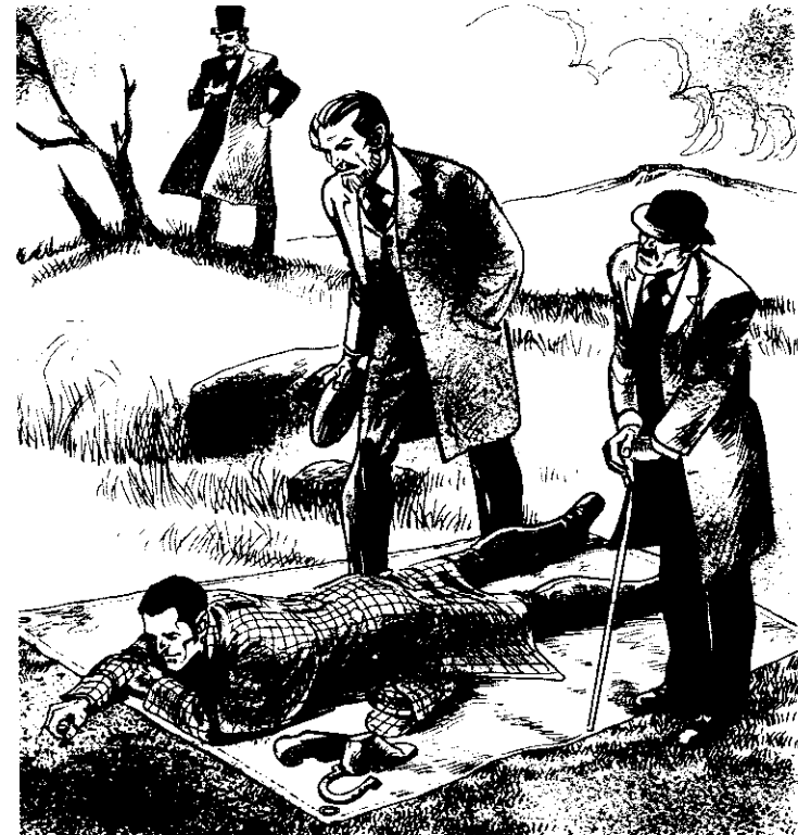
Holmes began to look at all the tracks in the mud.