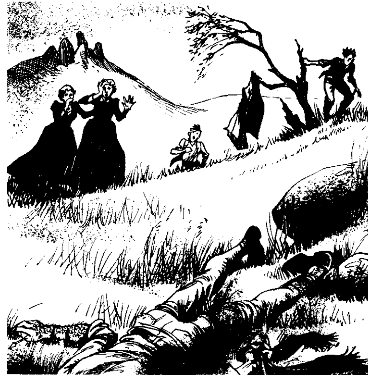
Just past the tree, they found the trainer. He was dead.

'It's the stranger's scarf,' he told us. 'When I went to get the dog, that stranger was still at the stable window. He put something in my meat curry, to make me sleep – I