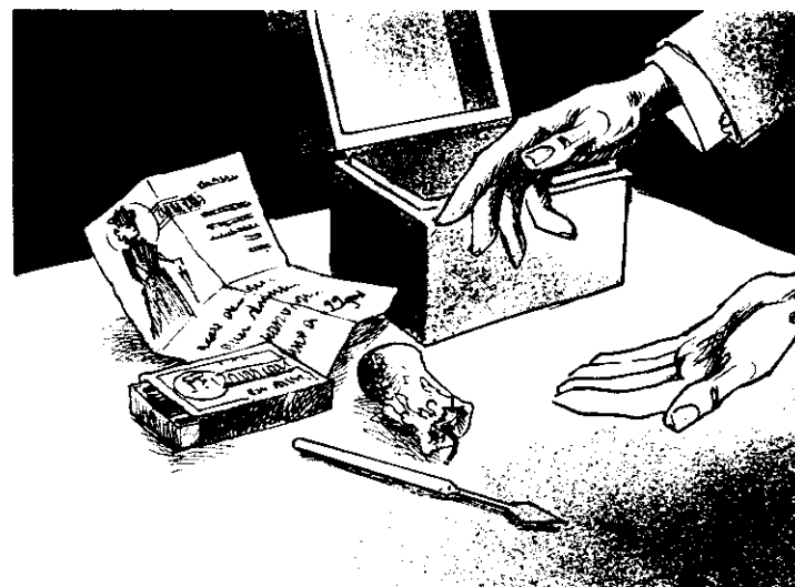
The Inspector opened a box and put things on a table.

We went into the front room, and the Inspector opened a box and put things on a table. There was a box of matches, a small piece of candle, some money, a watch, some papers, and a small, thin knife.