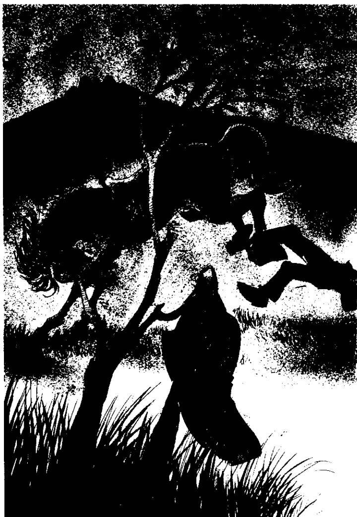
Silver Blaze kicks out, and Straker goes down, into the mud.

into the mud, and the knife in his hand goes into his own leg. The horse disappears into the night.'