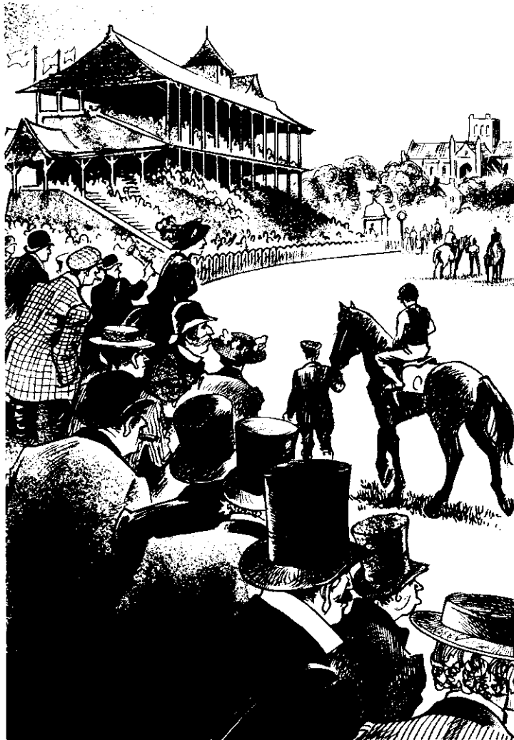
Silver Blaze came past us, looking strong and well.

And there was Silver Blaze, a big brown horse with a white nose. He came past us, looking strong and well, and ready for anything.