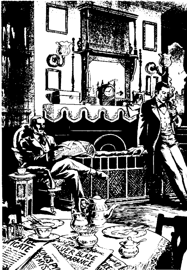
'Where is Silver Blaze?' the newspapers asked.

Pyland two things happened. Someone killed John Straker, and Silver Blaze disappeared.