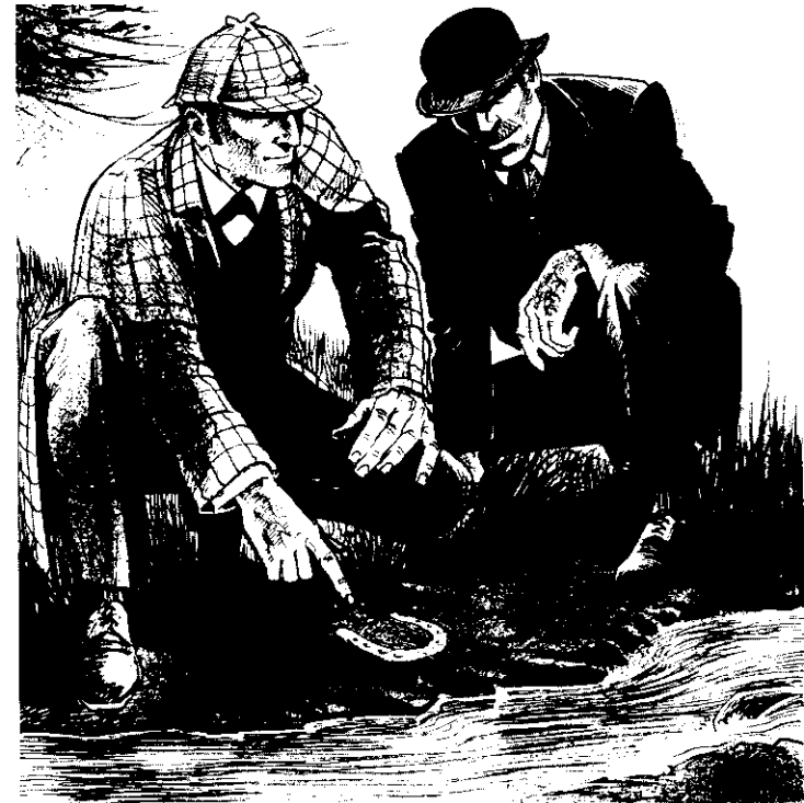
Holmes put the horseshoe next to the tracks. ‘Yes, that’s Silver Blaze.’

‘Here they are,’ I cried. ‘And look – there’s another track here, of a man’s shoe.’