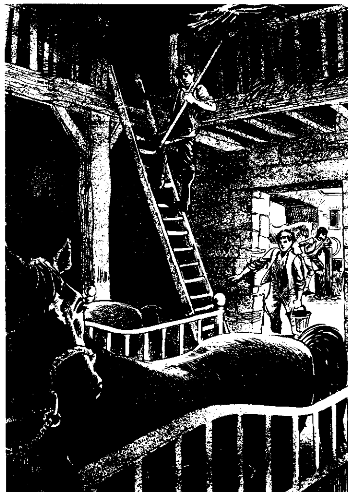
There are four horses in the training stables, and three boys working for Straker.

‘Now, let’s look at the people and the place. The trainer, John Straker – a good man and wonderful with horses – worked for Mr Ross for twelve years. There are four horses in the training stables, and three boys