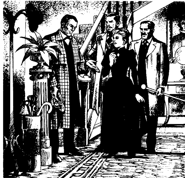
'It was in Plymouth, at a garden-party. Do you remember?'

'Well, well, I am wrong, then. I am so sorry.' And with that Holmes followed the Inspector outside. The four of