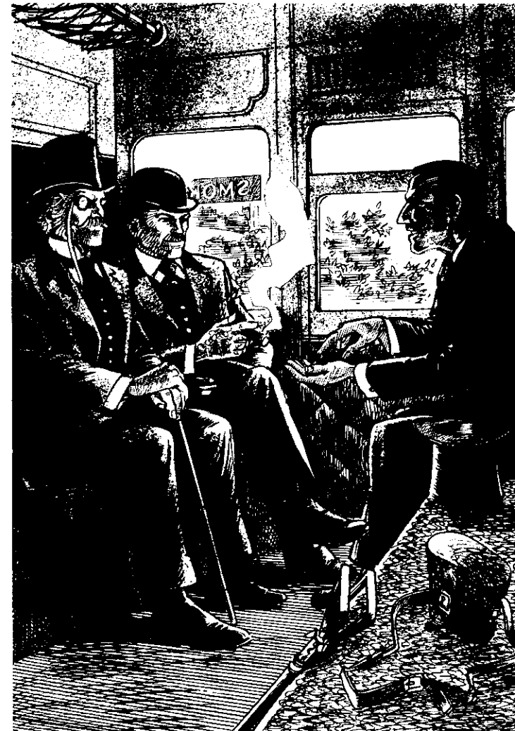
On the train Holmes told us the story behind the mystery.

‘Do you know the taste of opium?’ Holmes said. ‘No? Well, it’s not a very strong taste, but it’s there. You can taste it in most food, but not in curry. Curry has a very strong taste, stronger than opium. So the killer says, “I need a night when the dinner is a meat curry. Then Ned Hunter can eat his dinner happily, without the taste of opium – and go to sleep.” But did Fitzroy Simpson know that curry was the dinner on Monday night? Of course not. How could he? He didn’t make the dinner, he was a stranger at King’s Pyland, he knew nobody in the trainer’s house. So, we forget Simpson, and think again. Who knew about the curry before dinner on that Monday night?’