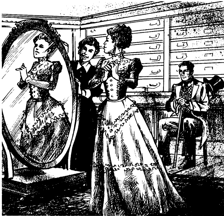
Straker needed more money for the expensive Mrs Darbyshire.

‘Ah, yes. The horse was safe and well, and with a friend,’ said Sherlock Holmes. ‘I can’t tell you who or where, because I made a promise. But here we are, nearly in London. You have the answer to the mystery, Mr Ross, you are the winner of the Wessex Cup, and the owner of the fastest racehorse in the south of England. What more do you need?’