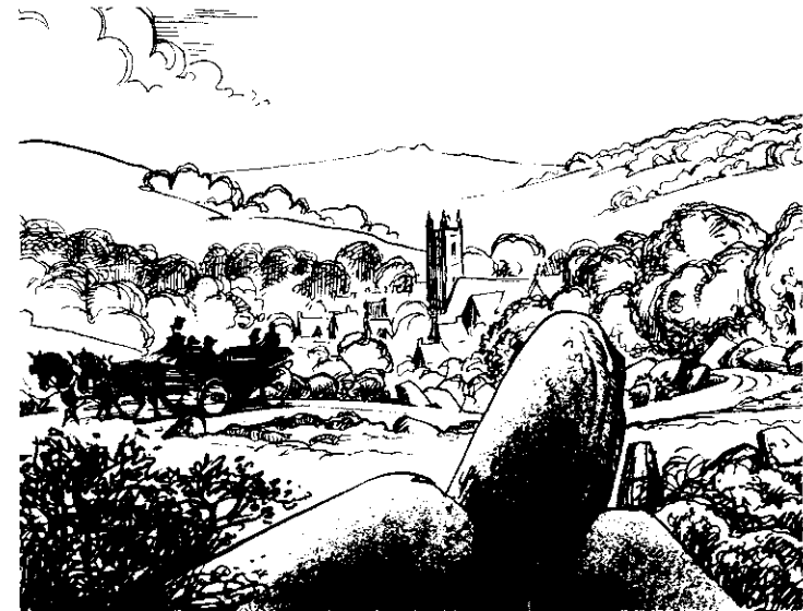
We were soon up on the brown hills of the moor.

We were soon out of the little town and up on the brown hills of the moor.